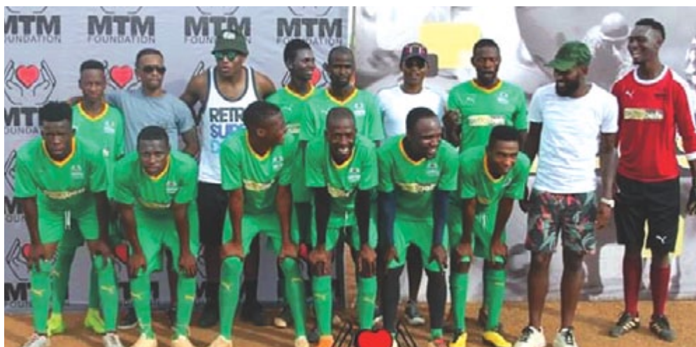
The Annual Mpho Makola Football Tournament winners Twins FC were crowned champions and walked away with R60 000 cash, a Puma soccer kit, a big trophy and gold medals.