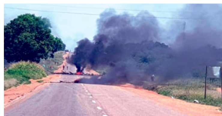
The N11 Road was barricaded with burning tires when Masakaneng residents were protesting against the lack of schools.

Foreign owned shops were broken into and looted during a protest by Masakaneng community members when demanding schools from the government.